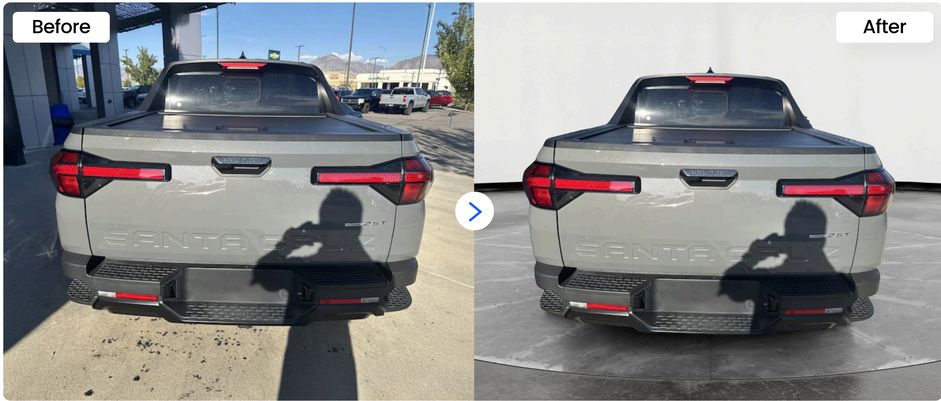
Shadows captured during shooting mode will be visible in the final image

Avoid casting your own shadow onto the car