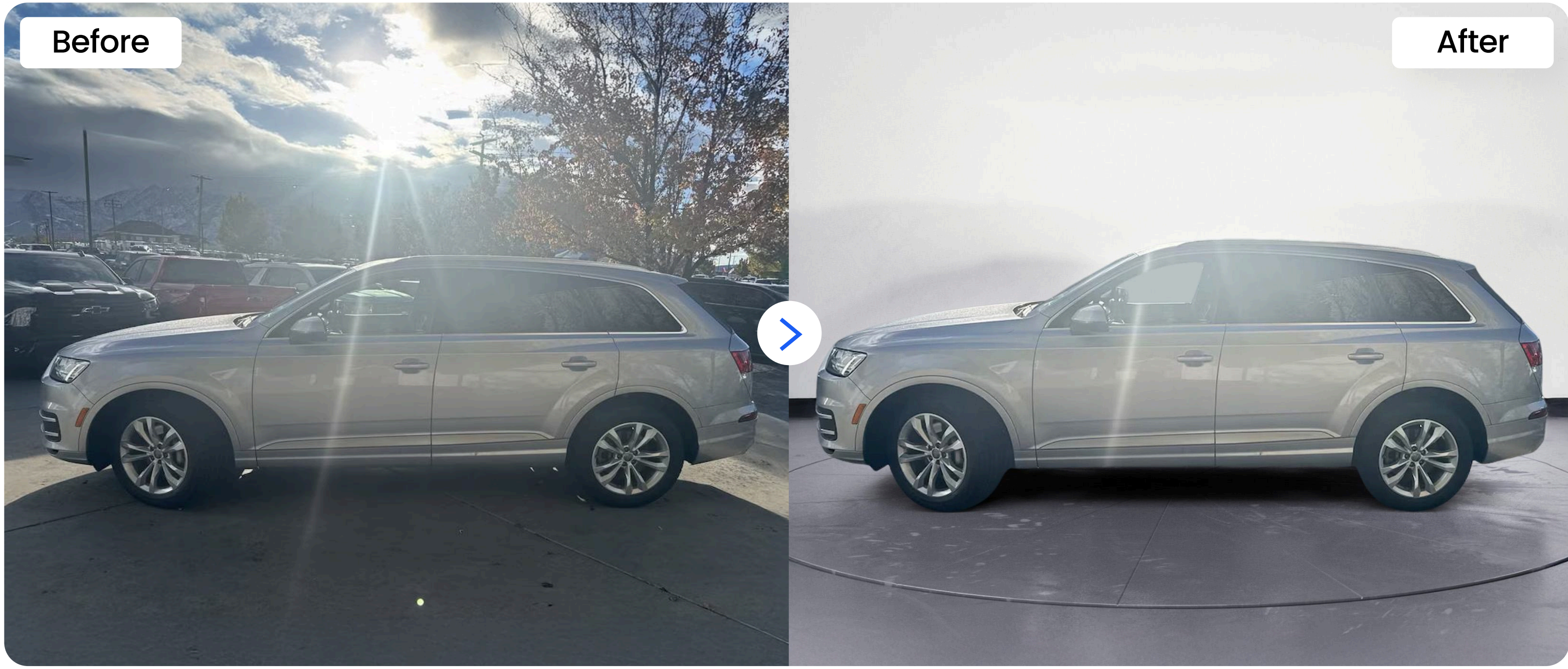
Shooting into the sun creates reflections on the vehicle and reduces image quality

Avoid shooting directly into the sun when capturing a vehicle